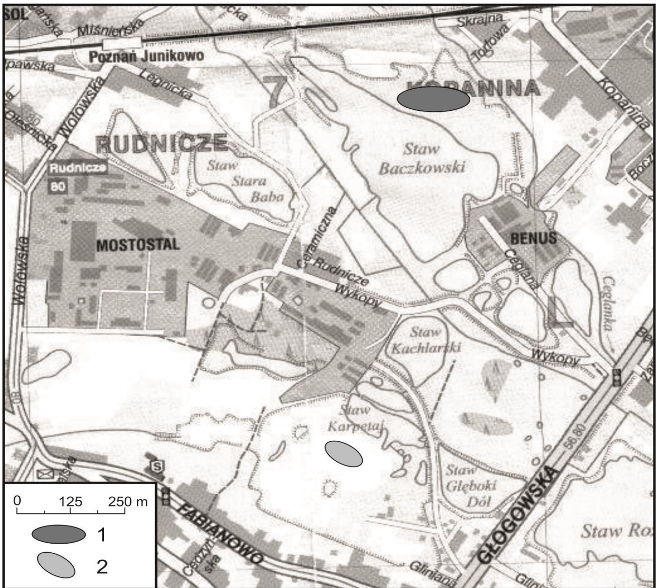
Fig. 1. Location of the studied populations of E. palustris within the south-western part of Poznań city (1:18 000; Poznań city plan, 2014). 1 – population associated with Baczkowski Pond, 2 – population associated with Karpetaj Pond

The site of E. palustris by the Baczkowski Pond was first described by Jackowiak (1993). Since 2005 it has been monitored three times. The site by the Karpetaj Pond was first documented in 2002 (Wyrzykiewicz-Raszewska, 2006). The research on E. palustris populations, involving plant spatial structure, were carried out on the whole area of species distribution, both at the Baczkowski (4400 m 2 ) and Karpetaj (980 m 2 ) ponds. The observation area was divided into squares of side 20 m. In each square the accurate number of ramets (orchid stems) was determined. For both sites within a chosen area of 100 m 2 the average density, congestion factor and the coefficient of dispersion were calculated (Collier et al. , 1978; Trojan, 1975). In both investigated populations for 250 ramets in the generative phase, the following traits were measured or counted: stem length (1), length of inflorescence (2), number of flowers per raceme (3), number of leaves per ramet (4), length (5) and width of the largest leaf (6). Obtained data allowed statistical analyses to be conducted. Descriptive statistics were calculated (arithmetic average, standard deviation, minimum and maximum). A variation coefficient (V) was established